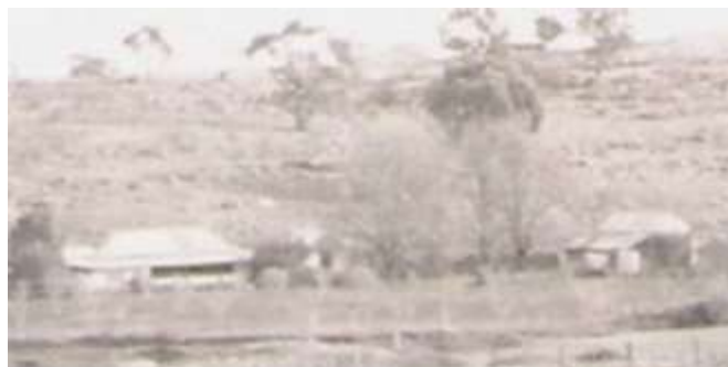
Signboard for the Lily of the West lodge, Molong Looking across the railway line to 'Briarjean'/'Briar Jean' c.1949

The lodge signboard was then erected on a fence post at Victor's home, 'Briarjean', West End, Molong. (Located just over the railway, on the right, on the road to Cumnock. Now derelict.)