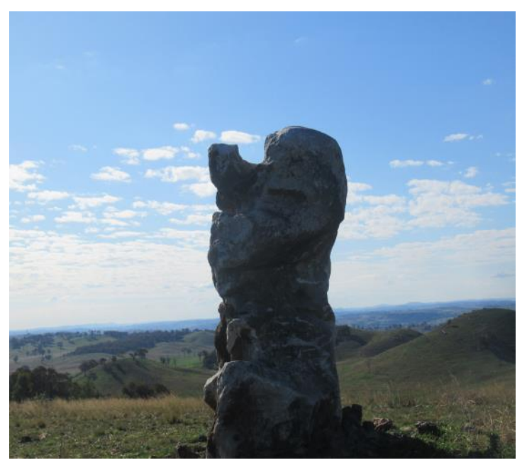
Does anyone know where this monument is located? Check page 5 For the answer.