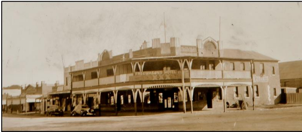
Above: The Freemason Hotel and adjacent building was Blackall's Chemist Shop. August 1935.