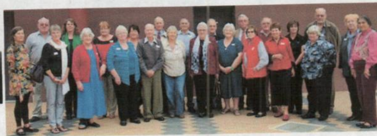
Participants in the oral history component of the Villages of the Heart project.

The Molong Historical Society has contributed to all the programs above. The next project is "Villages of the Heart" Stage Two. "From Pasture to Plate" If you would like to know more please contact the Society.