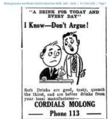
PHOTOGRAPHS Recent photo of 1 Shields Lane Turley Ad August 1924 Molong Express Cartoon Ad 1950 Molong Express.

anything on the Molong Cordial Factory which was located at 1 Shields Lane. There were several other small businesses including one at Wellington run by the Matthews family.